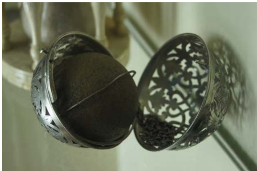
Fig. 9 – Spherical oriental bezoar within a silver Indo-Portuguese filigree container. 17th century. Size: diameter of bezoar 6,5 cm; diameter of the container 9 cm. Távora Sequeira Pinto Collection (Oporto).

Slika 9 – Okrugli istočnjački bezoar u indo-portugalskoj srebrnoj filigranskoj kutijici iz 17. stoljeća. Dimenzije: promjer bezoara 6,5 cm, promjer kutijice 9 cm. Kolekcija Távora Sequeira Pinto (Oporto).