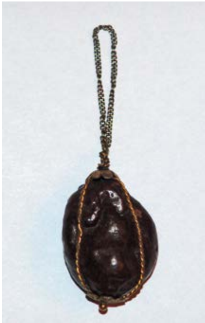
Fig. 7 - Oriental bezoar stone pendant, attached to a golden chain. 17 th century. Size: height: 6.4 cm, diameter 3.8 cm. Távora Sequeira Pinto Collection (Oporto)

Slika 7 – Privjesak s istočnjačkim bezoarom na zlatnom lancu. 17. stoljeće. Dimenzije: visina 6,4 cm, promjer 3,8 cm. Kolekcija Távora Sequeira Pinto (Oporto)