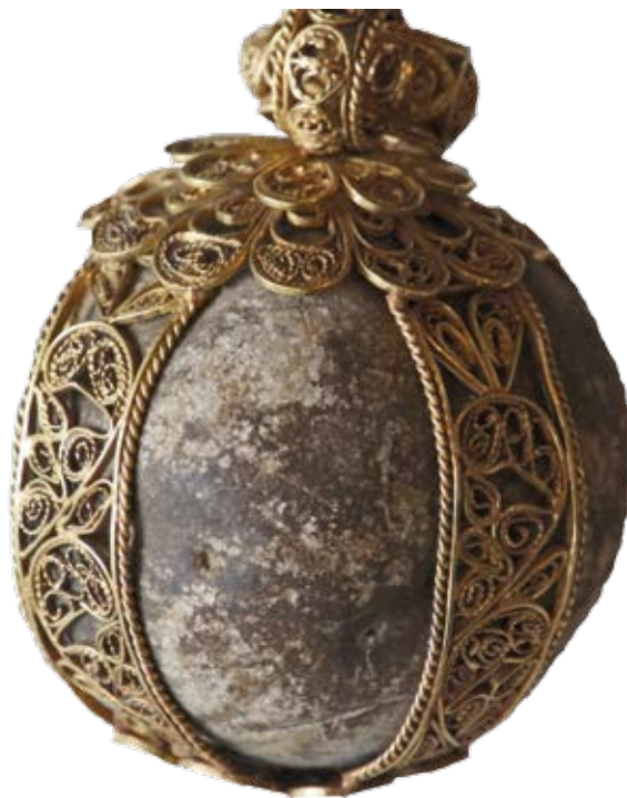
Figure 5 - Oriental bezoar mounted on Indo-Portuguese golden filigree pendant. 16 th century. Size: height 9.4 cm, diameter 6.1 cm. Távora Sequeira Pinto Collection (Oporto)

Slika 5 – Istočnjački bezoar na indo-portugalskom filigranskom privjesku iz 16. stoljeća. Dimenzije: visina 9,4 cm, promjer 6,1 cm. Kolekcija Távora Sequeira Pinto (Oporto)