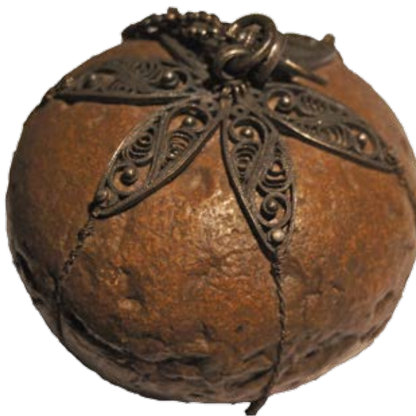
Fig. 6 - Oriental bezoar mounted on Indo-Portuguese golden filigree pendant in the form of a fruit. 17 th century. Size: height: 5.8 cm, diameter 8 cm. Távora Sequeira Pinto Collection (Oporto).

Slika 6 – Istočnjački bezoar na indo-portugalskom zlatnom filigranskom privjesku u obliku voća iz 17. stoljeća. Dimenzije: visina 5,8 cm, promjer 8 cm. Kolekcija Távora Sequeira Pinto (Oporto)