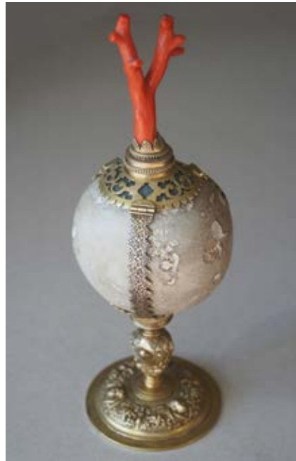
Fig. 8 – Oriental bezoar stone mounted on a golden filigree stand, decorated with a coral branch on the top. 18 th century. Size: height 25.6 cm, diameter 9 cm. Távora Sequeira Pinto Collection (Oporto)

Slika 7 – Privjesak s istočnjačkim bezoarom na zlatnom lancu. 17. stoljeće. Dimenzije: visina 6,4 cm, promjer 3,8 cm. Kolekcija Távora Sequeira Pinto (Oporto)