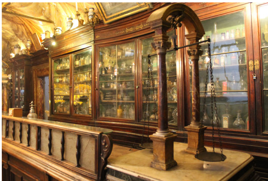
Figure 1. Pharmacy ( spezieria ) Santa Maria della Scala, Rome (Italy). Interior of the main hall.